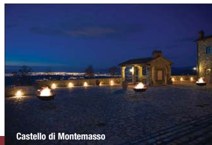
Castello di Montemasso