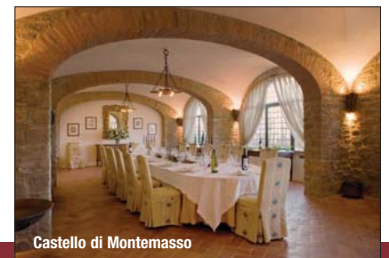
Castello di Montemasso

Information on all the hotels and golf courses can be obtained from Macana Golf & Leisure - Email: info@macanagolf.it