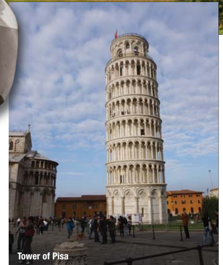
Tower of Pisa

Pisa is an architectural jewel, with the aura of history and tradition. The suites are classic design decorated with original 17th century pastel murals, the décor is fascinating in all the public rooms in fact the entire location is superb. The visit to the spa was an experience to savour, rejuvenating the body before the pleasures of the restaurant.